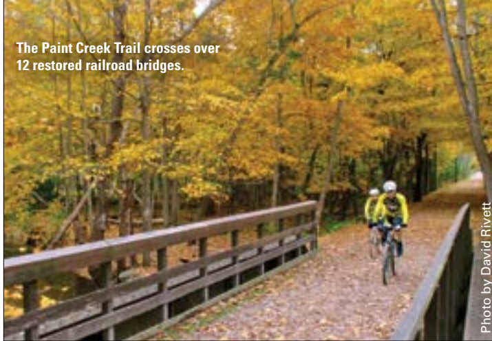
The Paint Creek Trail crosses over 12 restored railroad bridges.

Experience the fall colors on the Polly Ann Trail between Oxford and Leonard.